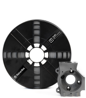
SLATE GREY MP06997