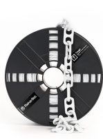
STONE WHITE 375-0008A