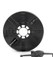
ONYX BLACK 375-0007A