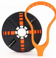
SAFETY ORANGE 375-0009A